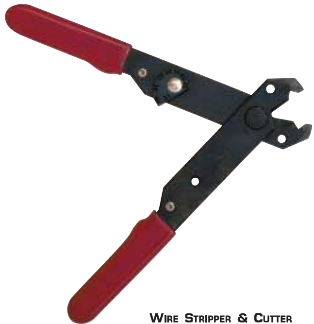
WIRE STRIPPER & CUTTER