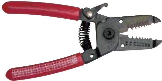
20-30 AWG WIRE STRIPPER