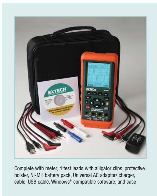
Complete with meter, 4 test leads with alligator clips, protective holster, Ni-MH battery pack, Universal AC adaptor/ charger, cable, USB cable, Windows ® compatible software, and case