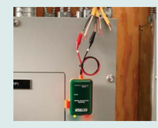
Use for local continuity or for remote wiring identification.

Continuity Tester includes Remote probe with bi-color LED for wire identification highlight