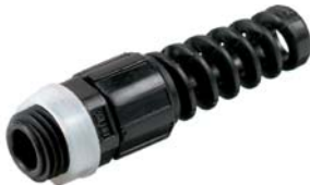
Black Cord Connector with Spiral