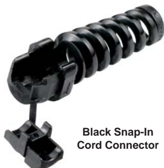
Black Snap-In Cord Connector