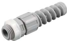
Gray Cord Connector with Spiral