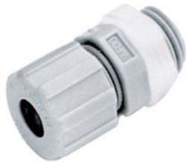
Gray Cord Connector