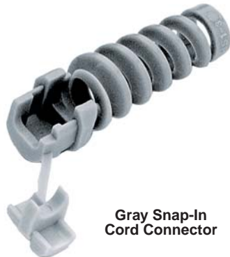
Gray Snap-In Cord Connector