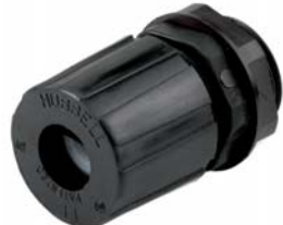
Black Cord Connector