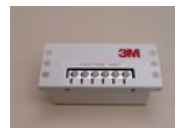
3M™ Hot Melt Oven 120V 6312