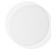
3M™ Lapping Film 863XW, 0.02 Micron Disc, 5 in x NH, 50 per inner 500 per case