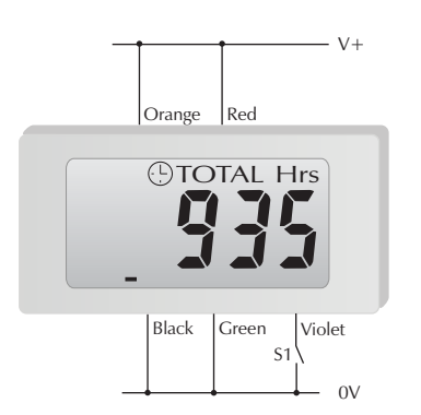
Leading zeros blanked. Close S1 to select TRIP mode.