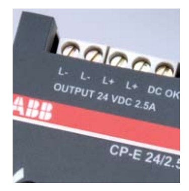
"DC OK" output

The 24 V units of the CP-E range, offer a transistor output for monitoring and remote diagnosis.