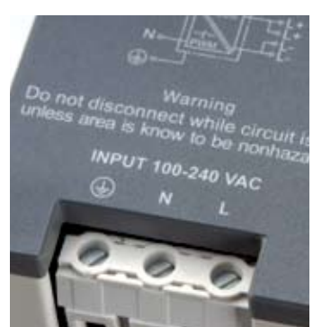
Wide input range

The 24 V units of the CP-E range, offer a transistor output for monitoring and remote diagnosis.