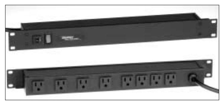
JO8BOB (Front & Back)

Wiremold/Legrand also offers extensive custom capabilities for Plug-In Outlet Center Units. Contact the factory for more information.