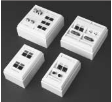
5700 Series boxes with Pass & Seymour Activate inserts.