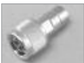
'N' Terminator (M) 1W @ 2%