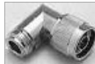
Right Angle ' N ' (M) to ' N ' (F), UG-27/U