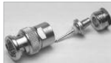
Solder or Crimp BNC (M) 3 Piece