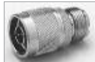
'N' (M) to UHF (F) UG-146/U