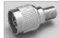
'N' (M) to 'F' (F)