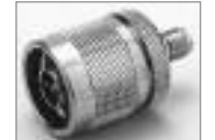
'N' (M) to SMA (F)