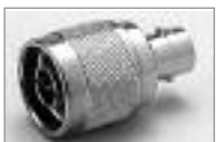
'N' (M) to BNC (F) UG-201U