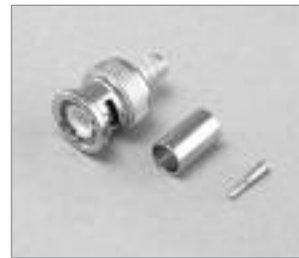
Crimp BNC (M) 3 Piece