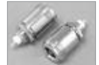
Chassis Mount 'N' (F)