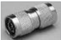
Inline Splice ' N ' (M) to ' N ' (M), UG-57B/U