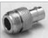
'N' (F) to BNC (F) UG-606/U