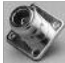
Chassis Mount ' N ' (F) to Solder Lug UG-58B/U