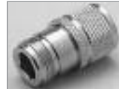
'N' (F) to UHF (M) UG-83/U