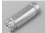
Inline Splice ' N ' (F) to ' N ' (F), UG-29B/U