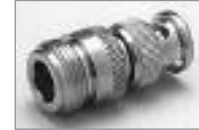
'N' (F) to BNC (M) UG-349/U