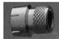
Twist-On F-59TW (M) for RG-59 with Male Quick Disconnect.