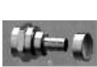
Crimp-On F-59 (M) with Separate 1/8" Ring.

(Use 24-7710 or 24-8866P for the following connectors)