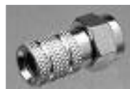
Twist-On F-56 (M) for standard RG-6 Cable.