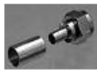
Crimp-On F-59 (M) with Separate 1/2" Ring.