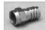
Crimp-On F-56ALM (M) for RG-6 Cable, Zinc Plated.