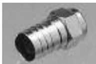
Crimp-On F-56ALM (M) for RG-6 Cable.