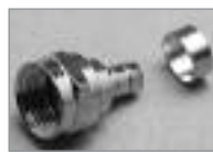
Crimp-On Gold Plated F-59 (M) with Separate 1/8" Ring.