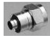
Crimp-On F-59A (M) with Attached 1/8" Ring.