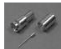
Crimp-On F-11 (M) 3 Piece, for Teflon/Plenum RG-11 Cable.