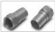
Gel Filled 'F' (M) Crimp, 0.324 Diameter, with O-ring for Weatherproof Application.