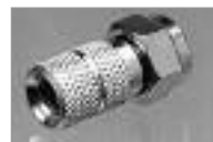
Twist-On F-59TW (M) with 1/2" Grip for Standard RG-59.