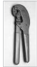
'F' Deluxe Hex Crimp Tool for RG-6 & 59.