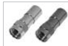
'F' Compression (M) New! Crimp, 1 Piece for Weatherproof Applications (use crimp tool 24-77144P).