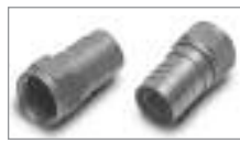
F-56ALM WP (M) Crimp, 1 Piece, 0.324 Diameter, Chromate Plated, with Interior Gasket.