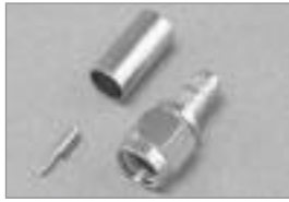
SMA for Flexible Cable (M) Crimp, 3 Piece, Solder or Crimp Center Pin