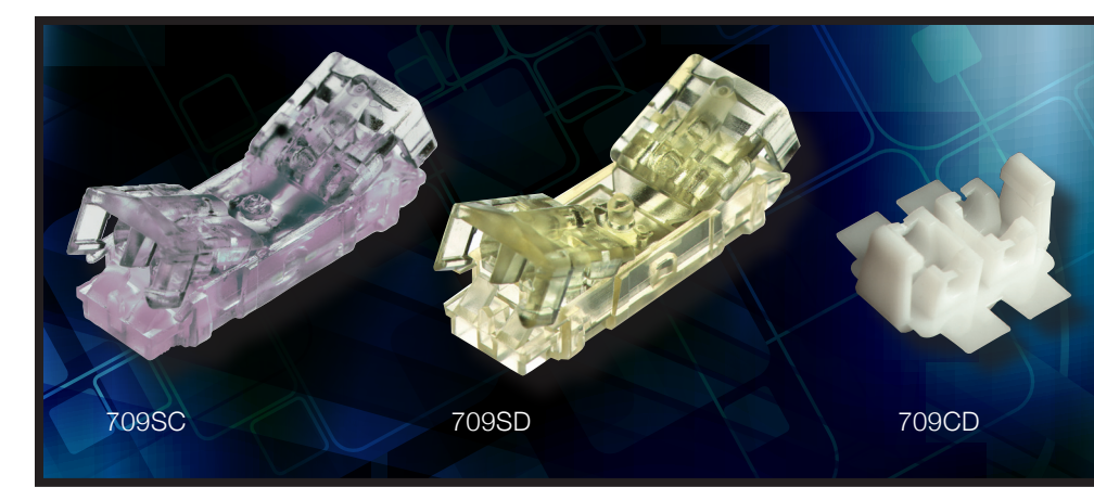
Note: Connectors shown above are for reference only.