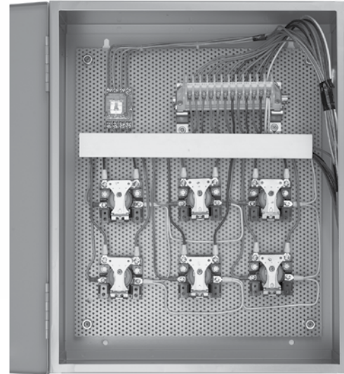
Example of Integrated Panel; wiring devices not included.