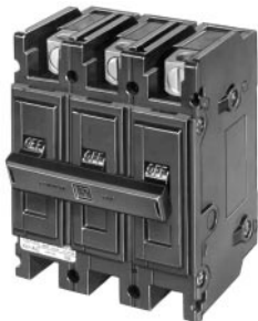
QUICKLAG Type QC 3-Pole