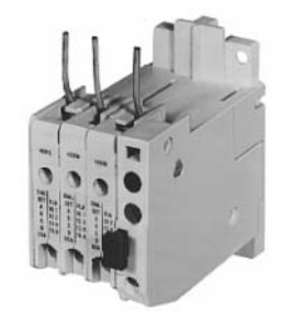
Superseded 32 Ampere Series "A" Overload Relay Cat. No. C306DN3

When replacing a Catalog Number C306DN3 (Part Number 10-6044) or C306GN3 (10-6319) Series "A" overload relay on a starter, order a Series "B" overload relay and Series "B" heater packs.