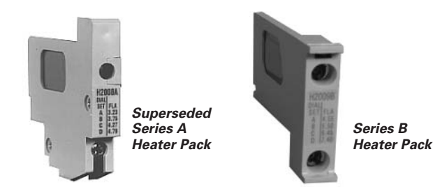
Table 34-343. Heater Pack Replacement Requirements

The heater pack series is determined by the 6th character of the Catalog Number. Series A or prior heater packs (identified by either "A" or "-" as the 6th character) have built-in load lugs. Series B or later heater packs do not (load lugs are on overload relay). Replacement of Series A or earlier heater packs with Series B or later heater packs, requires the one time addition of Lug Adapter Kit C3606KAL1-3B to the Series A1 overload relay.