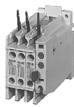
32 Ampere Overload Cat. No. C306DN3B

Note: For more information, see CA03402001E.