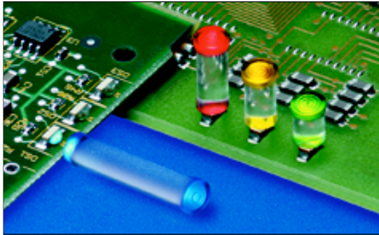
U.S. & Foreign Pat. Pend.