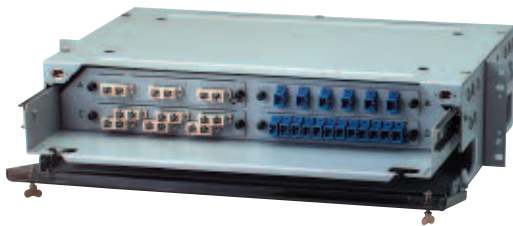
AX100078 FiberExpress (3U) Rack Mount Patch Panel