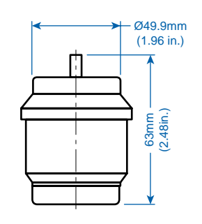
For DV fuses, please consult Altech.