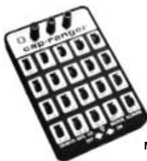
Model No. 3430

An economical, portable capacitance selector with three binding posts, one to ground the metal case.