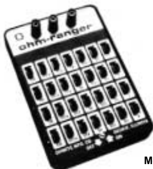
Model No. 3420

An economical, portable resistance selector with a range to over 11,000,000 ohms, in 1 ohm increments. Has three binding posts, one to ground the case.