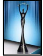
Electra Award 2005