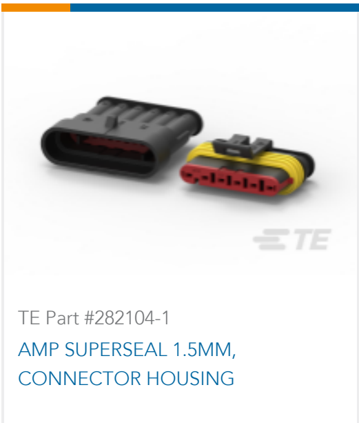
TE Part #282104-1 AMP SUPERSEAL 1.5MM, CONNECTOR HOUSING