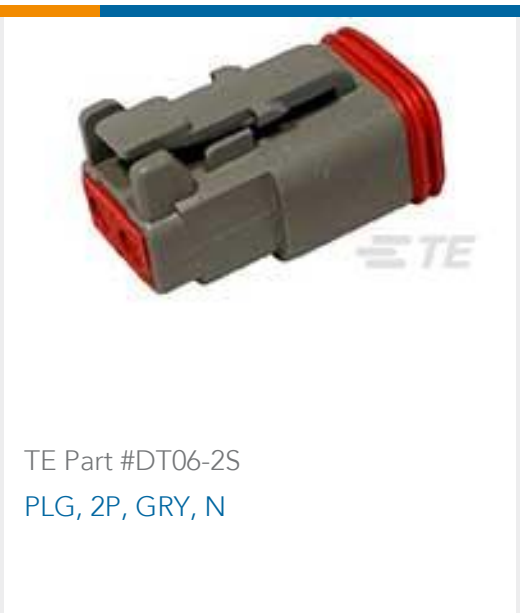
TE Part #DT06-2S PLG, 2P, GRY, N