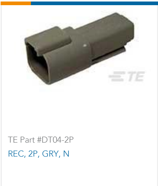
TE Part #DT04-2P REC, 2P, GRY, N