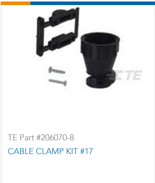
TE Part #206070-8 CABLE CLAMP KIT #17