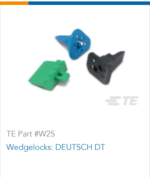
TE Part #W2S Wedgelocks: DEUTSCH DT