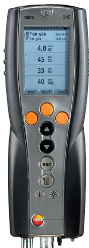
testo 340 4-Gas Emissions Analyzer