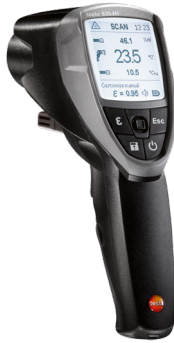
testo 835-H1 IR Thermometer with Humidity