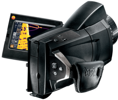
testo 890 High End Thermal Imager