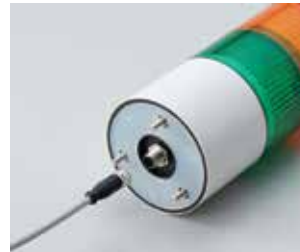
Reduces installation and replacement time.