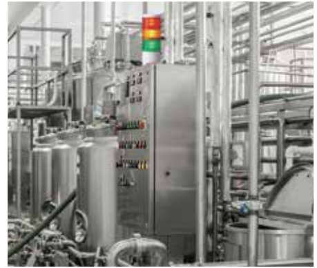
IP69K compliant. Ideal for food and pharmaceutical plants