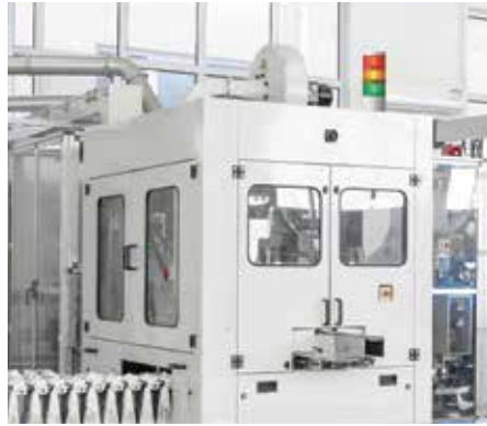
Status notification for control panels and industrial machinery