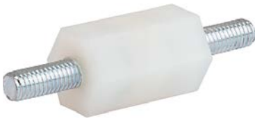
Transpillars Style 1

Transpillars, a rugged insulated mounting system