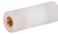
Transpillars Style 3