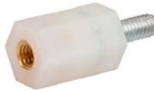
Transpillars Style 2