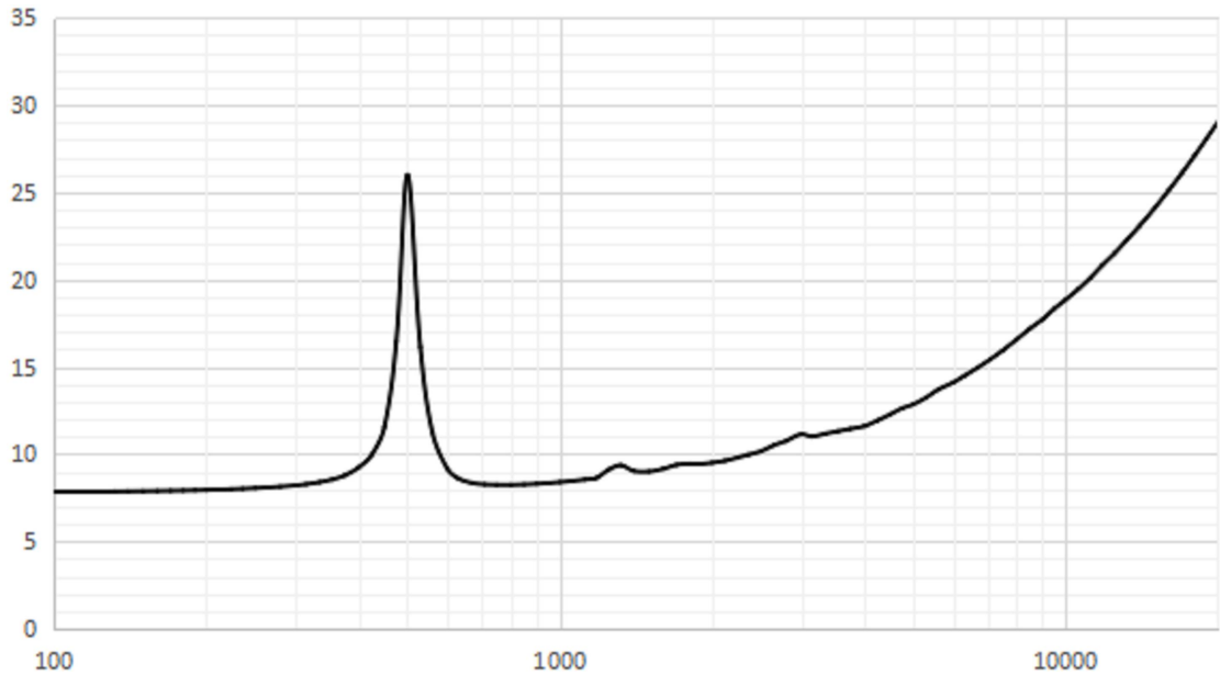
A: Frequency Response Magn 0 dB re 20.00 \mu Pa/V 1/12Oct