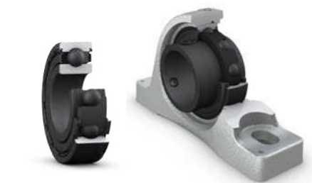
SKF 6212-2Z/VA228 SKF SY 50 TF/VA228

With grease removed from the process environment, relubrication procedures in potentially dangerous areas of the operation are no longer needed. Also, slippery surfaces from grease leakage and the risk of excess grease catching fire are eliminated. Versions of SKF high temperature bearings can also contribute to food safety as they are NSF H1 certified. See Core assortment table below.